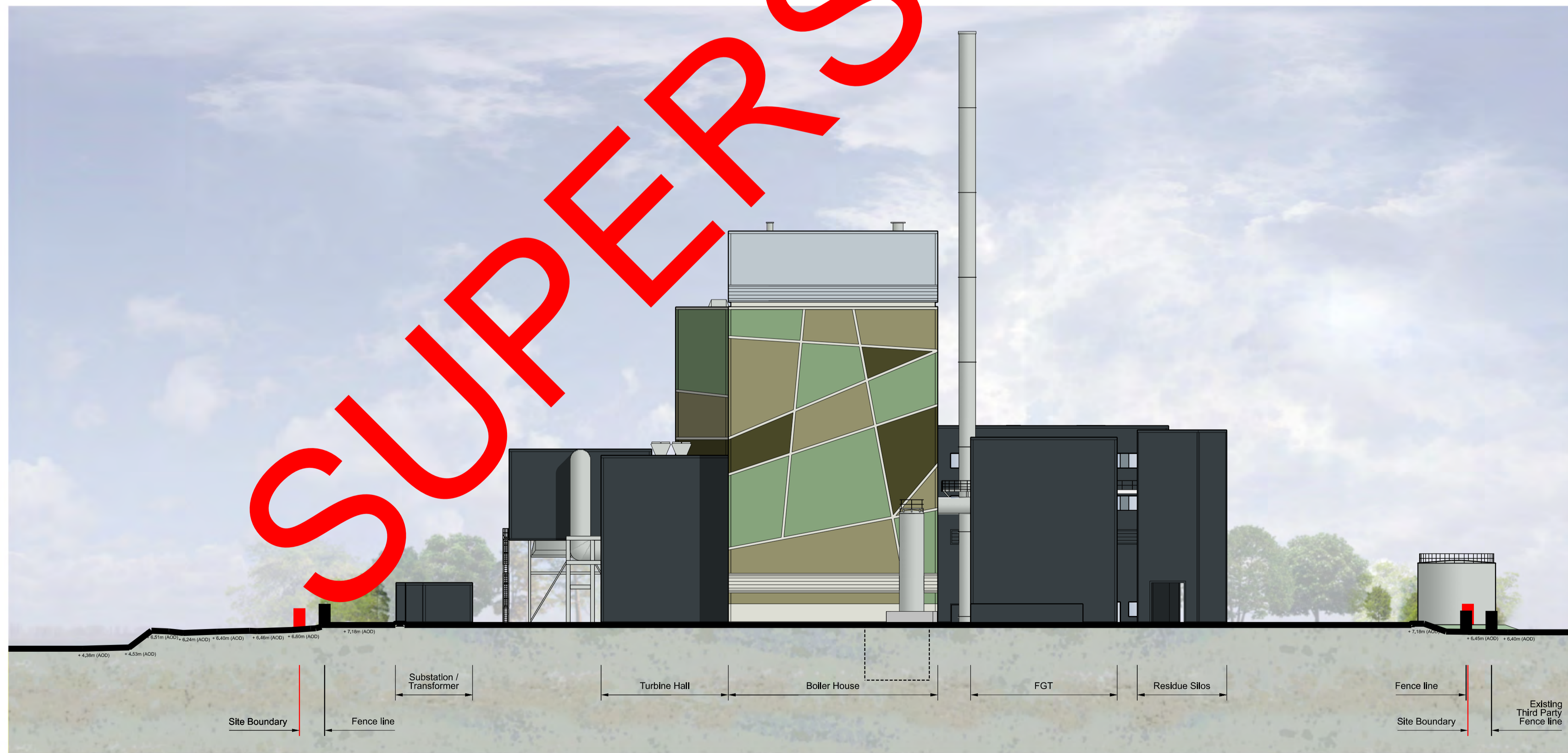
Section BB, Through The Site Looking South West