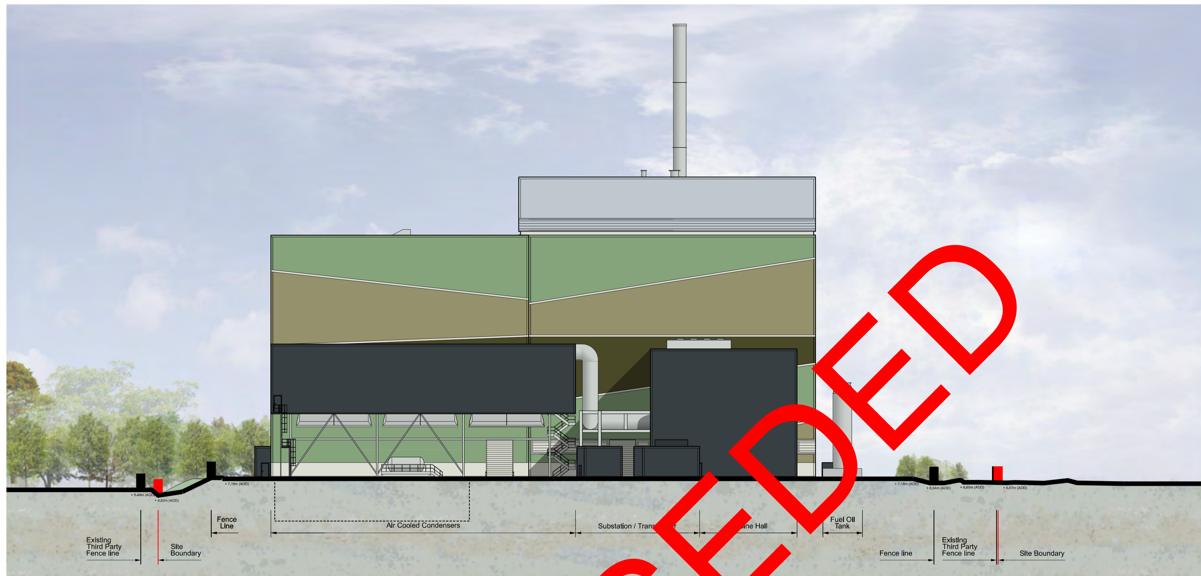
Section AA, Through The Site Looking North West